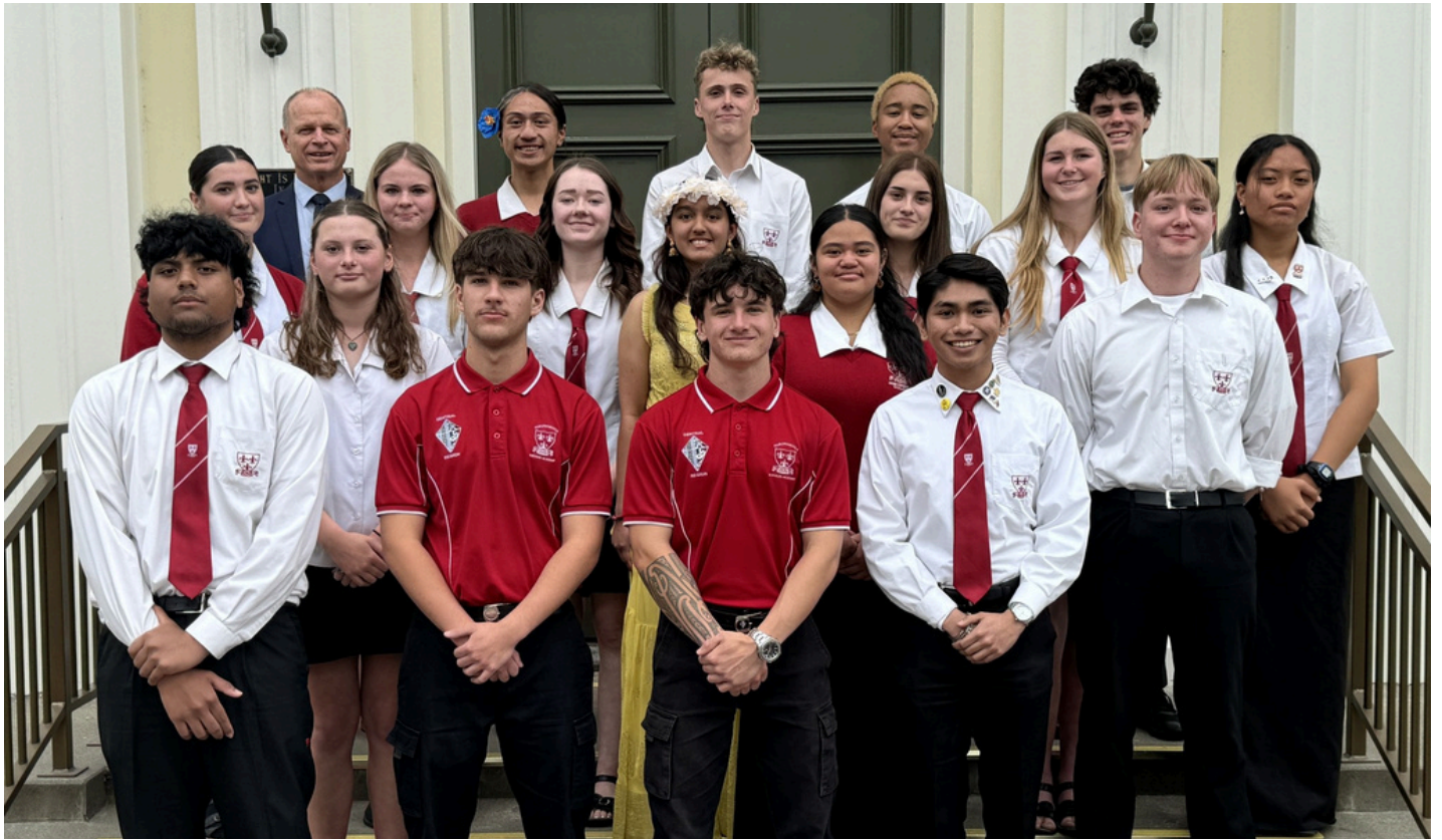
Outgoing prefects for 2024