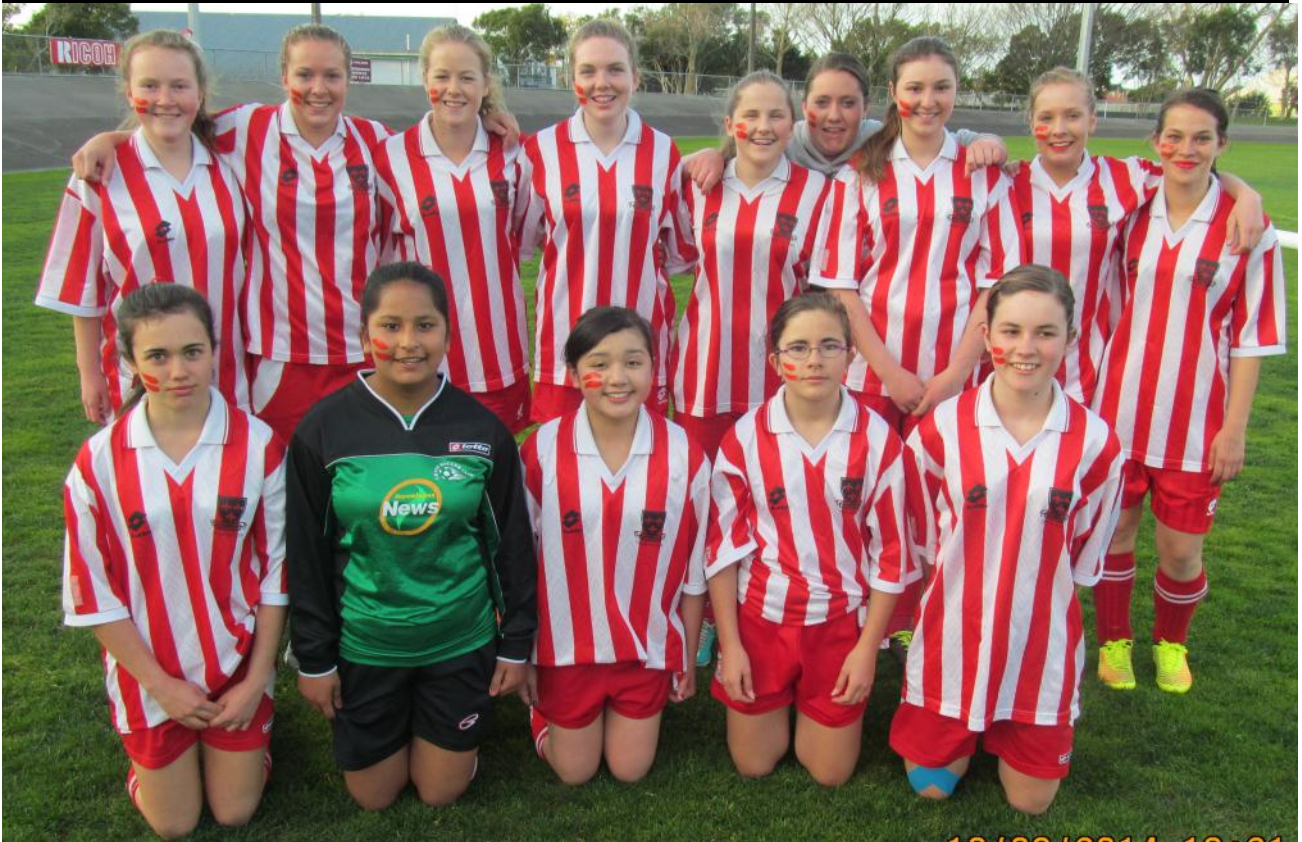
Above Girls First XI team.