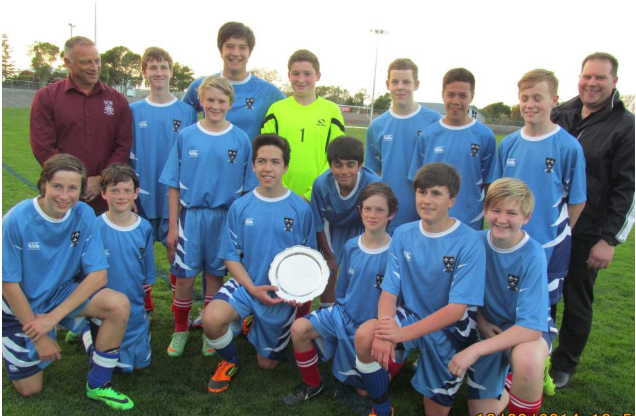
Below Boys U15 team.