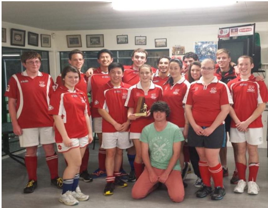
Senior Mixed Hockey Team: