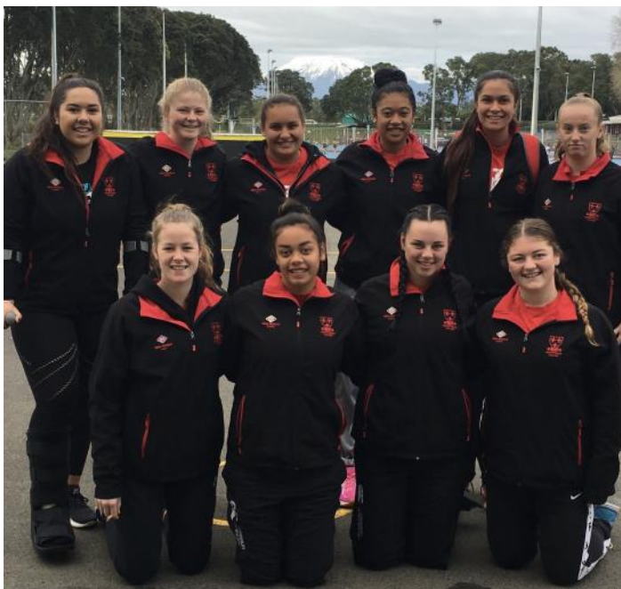
Previous Page: Girls 1st XI Hockey and Boys 1st XI Soccer