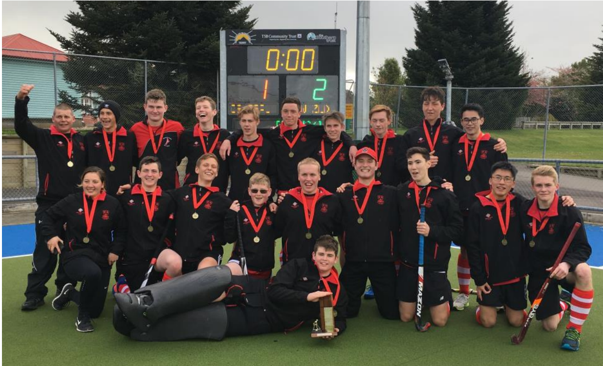
Above: Boys 1st XI Hockey - First place winners at the Woolaston Trophy Tournament in Stratford