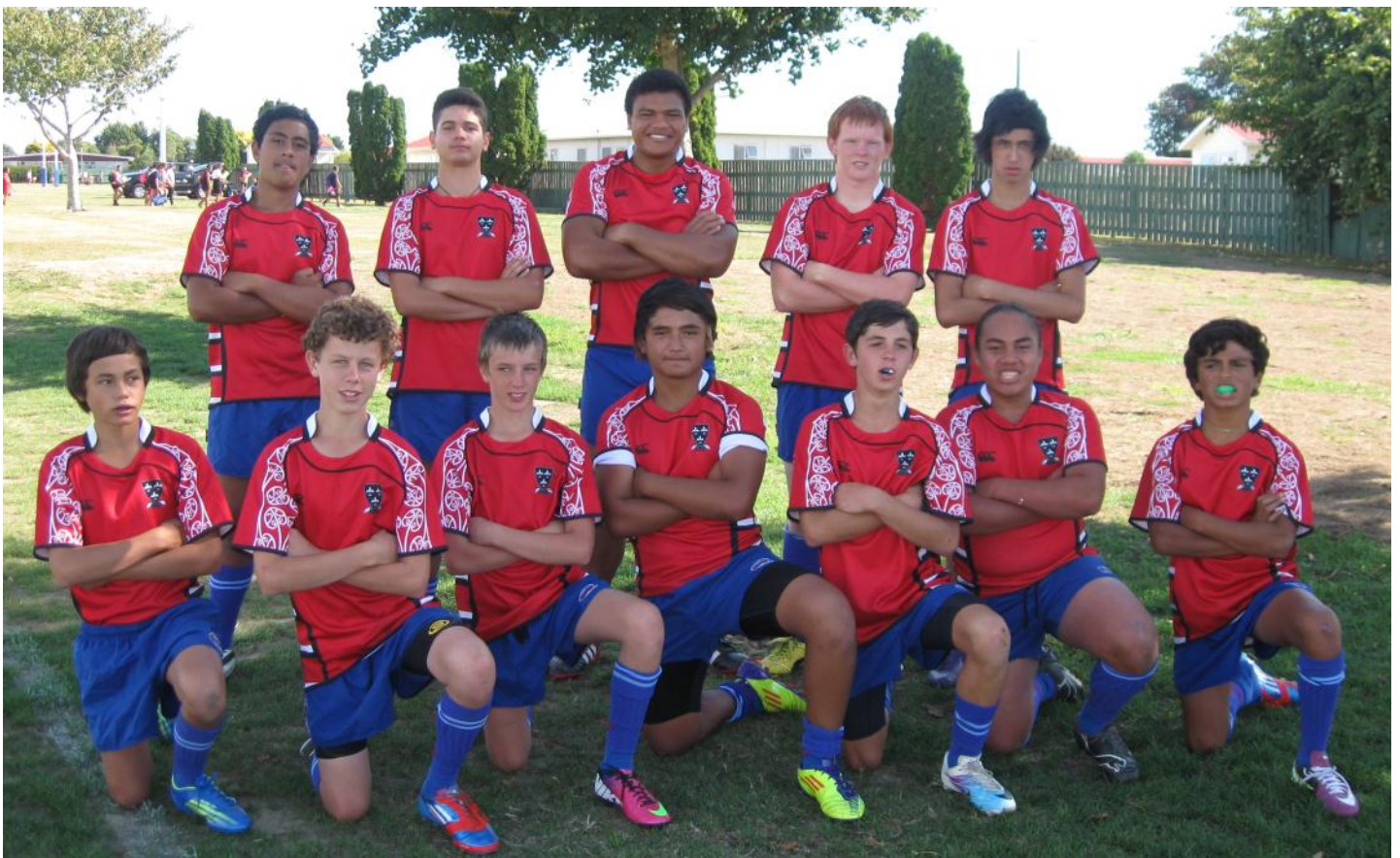
Under 15 Seven Aside Team came 3rd in HKRFU Tournament